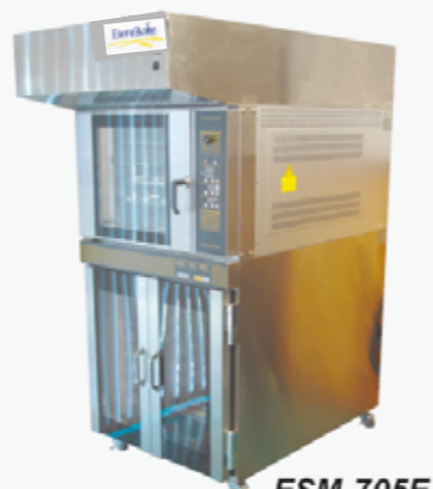
Shown with optional prover